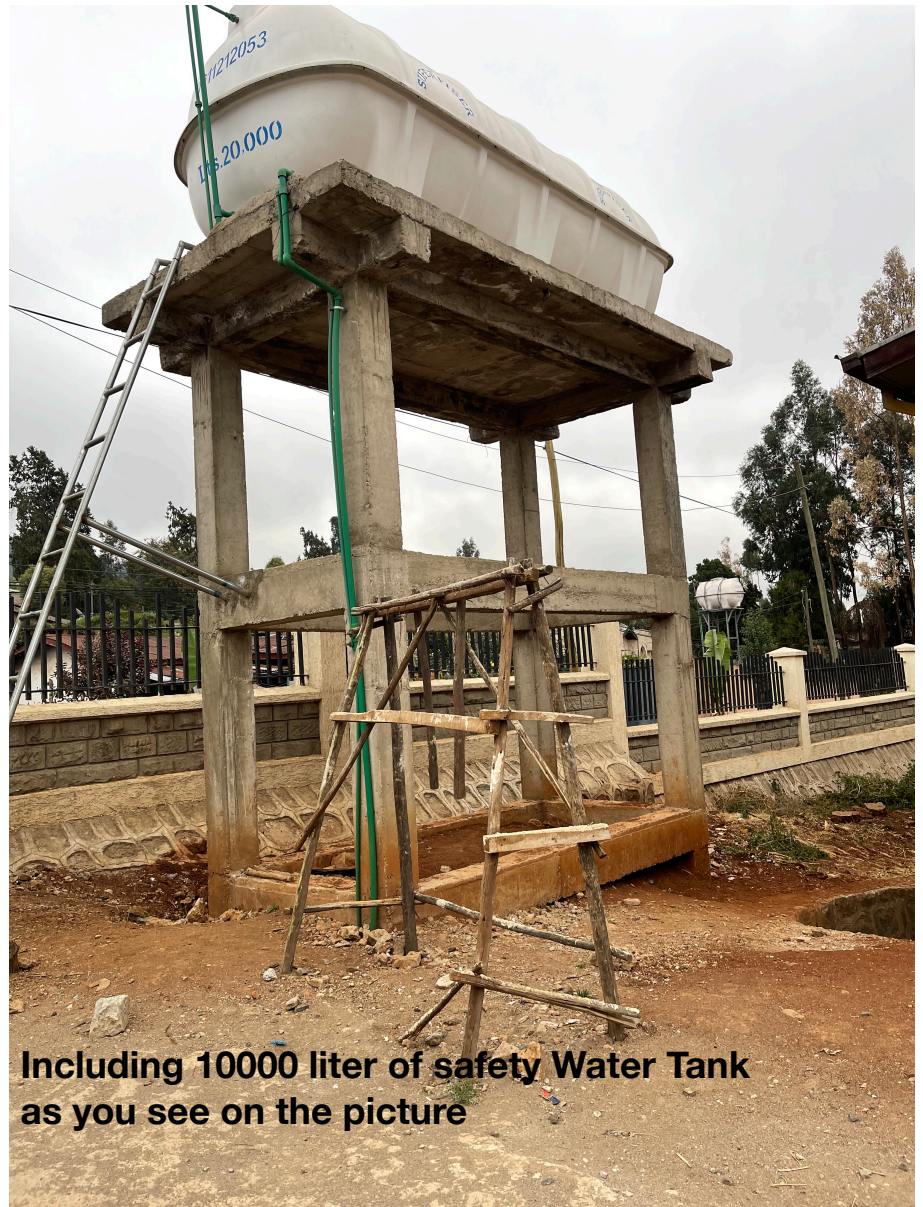
Including 10000 liter of safety Water Tank as you see on the picture

Currently there are 10 different private water industry in Sululta. The water industry have already drill water hole 300m far. As I originally planned, my Drilling in 2018 about 70 meter, that bring us not enough water to pump. Therefore we have decided to build a water safety tank for the school with the capacity of ,10,000 litter of water.